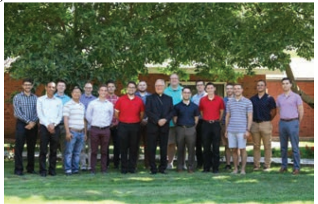
Seminarians for the Diocese of Providence.

“It’s encouraging people that it’s okay to give your life to Christ, to give your life to God and not be afraid of what you’re missing out in this world because there’s something greater.”